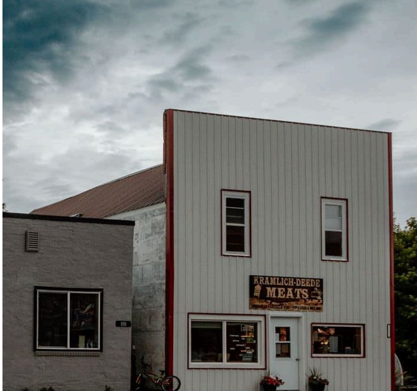
Kramlich –Deede Meats, Medina