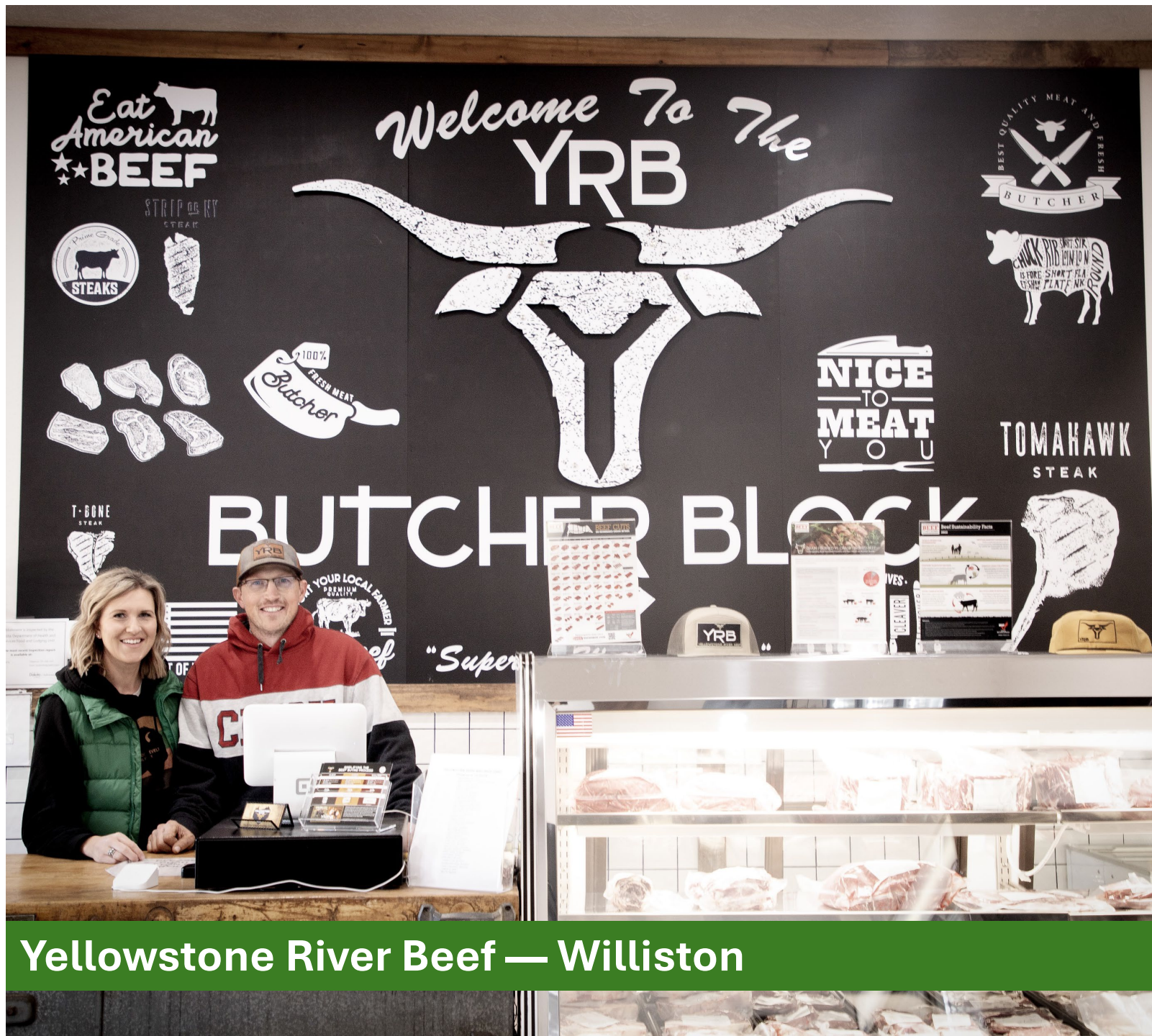
Yellowstone River Beef — Williston

Rural Development Finance Corporation GROWING COMMUNITIES