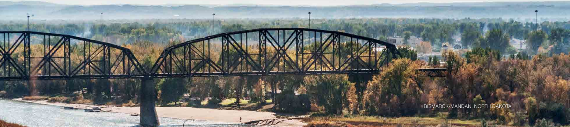
BISMARCK-MANDAN, NORTH DAKOTA