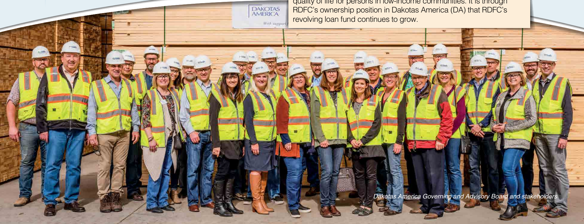
Dakotas America Governing and Advisory Board and stakeholders

Learning more about the projects Dakotas America and its investor partners help finance through the NMTC program is important to the governing board and advisory board members of Dakotas America—four of whom are representatives of the Rural Development Finance Corporation (RDFC). Dakotas America is co-owned by RDFC and Dakota Resources, a South Dakota non-profit entity. The members come together once per year to tour projects supported by or being considered for financing by the organization, which focuses on providing investment capital for projects designed to improve the quality of life for persons in low-income communities. It is through RDFC's ownership position in Dakotas America (DA) that RDFC's revolving loan fund continues to grow.