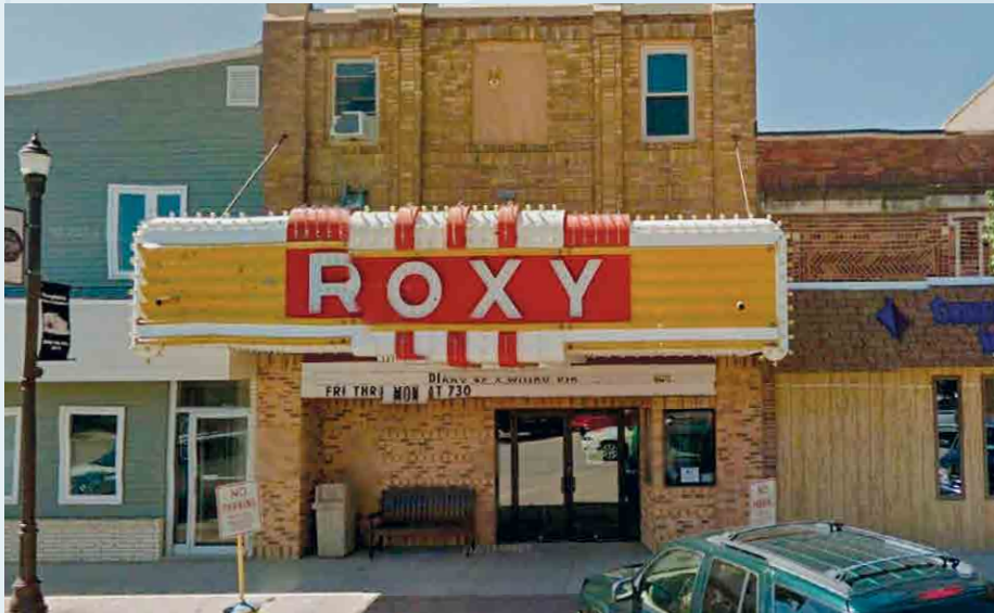
The Northern Lights Arts Council received a $500 grant from RDFC Member Cavalier Rural Electric Cooperative to renovate the lobby area at the historic Roxy Theater in Langdon (2018).